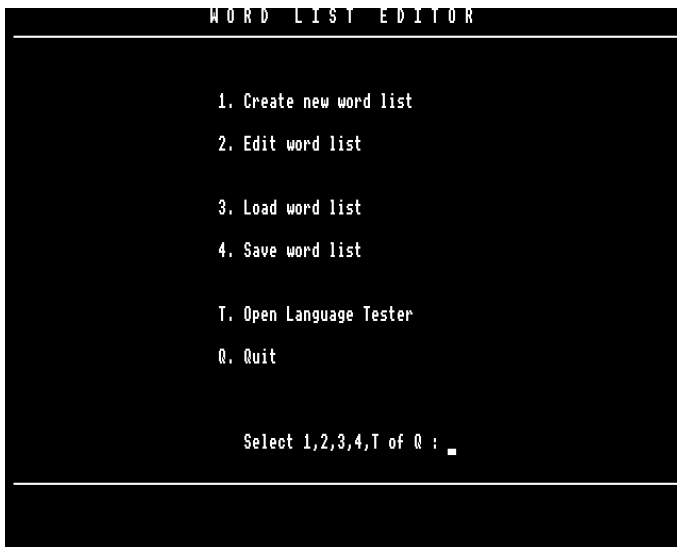
Fig. 1 - Word List Editor Main Menu

When the Word List Editor is started you are presented with a menu with 7 options as seen in figure 1.