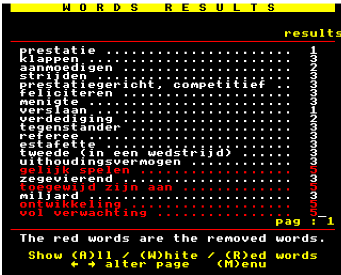
Fig. 3 - Summary screen

So let's say you have a word correctly answered 4 times, but the 5 th time is incorrect, the counter of that word will be set to 3. That means you have to translate it correctly 2 more times in future testing sessions before the counter gets to 5.